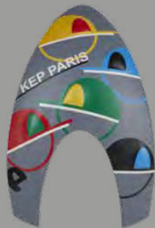
BOX.INS.F.KPA.GRY KEEP PARIS GREY LEATHER FRONT PANEL

THE KEEP PARIS FRONT PANEL GREY AND WHITE IS COMPATIBLE WITH ANY CHROME 2.0 MODEL CONFIGURATION