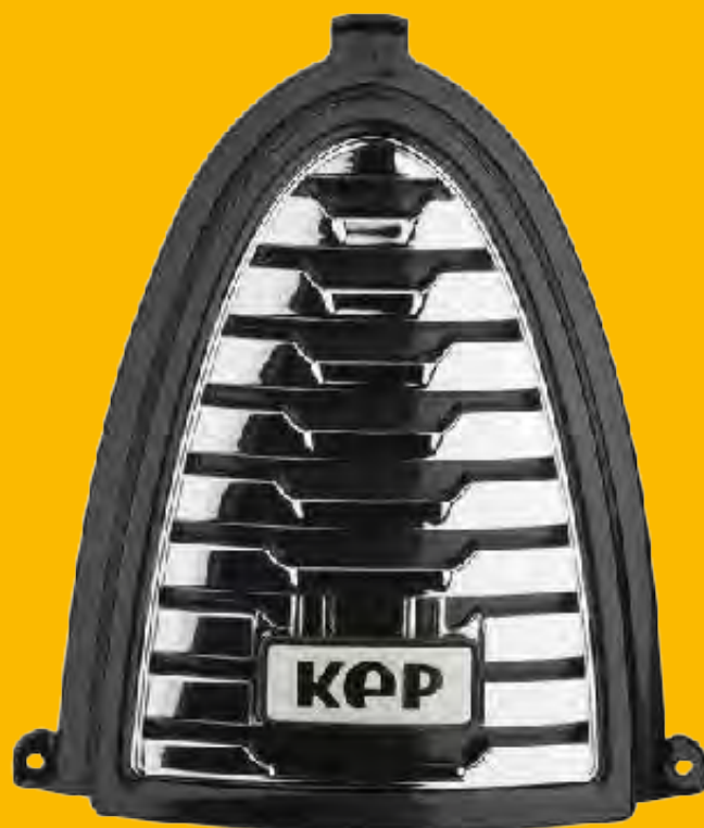
VENTILATION WITH CHROME GRILLE