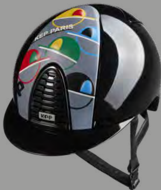
CRPL2.BLK.M/L.KPA.GRY CROMO 2.0 HELMET POLISH METAL BLACK POLISH METAL BLACK VENTILATION GRID POLISH BLACK VISOR BLACK CHINSTRAP KEEP PARIS GREY LEATHER FRONT PANEL SIZE M / L