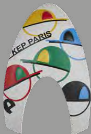
BOX.INS.F.KPA.WHT KEEP PARIS WHITE LEATHER FRONT PANEL