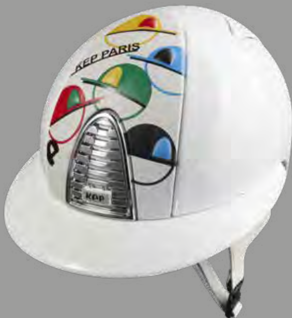
CRP2.WHT.M/L.KPA.WHT.PO CROMO 2.0 HELMET POLISH METAL BLACK POLISH METAL BLACK VENTILATION GRID POLISH BLACK VISOR BLACK CHINSTRAP KEEP PARIS GREY LEATHER FRONT PANEL SIZE M / L