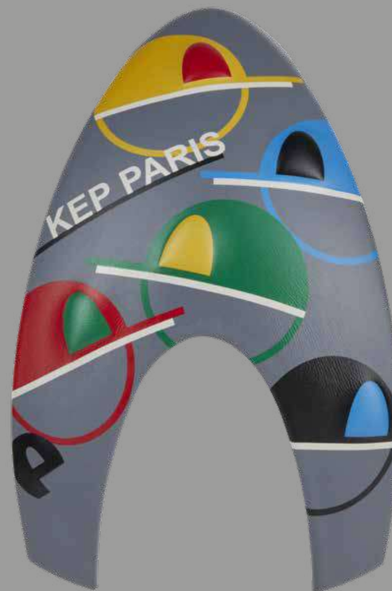
CRPL2.BLK.M/L.KPA.GRY CROMO 2.0 HELMET POLISH METAL BLACK POLISH METAL BLACK VENTILATION GRID POLISH BLACK VISOR BLACK CHINSTRAP KEP PARIS GREY LEATHER FRONT PANEL SIZE M / L