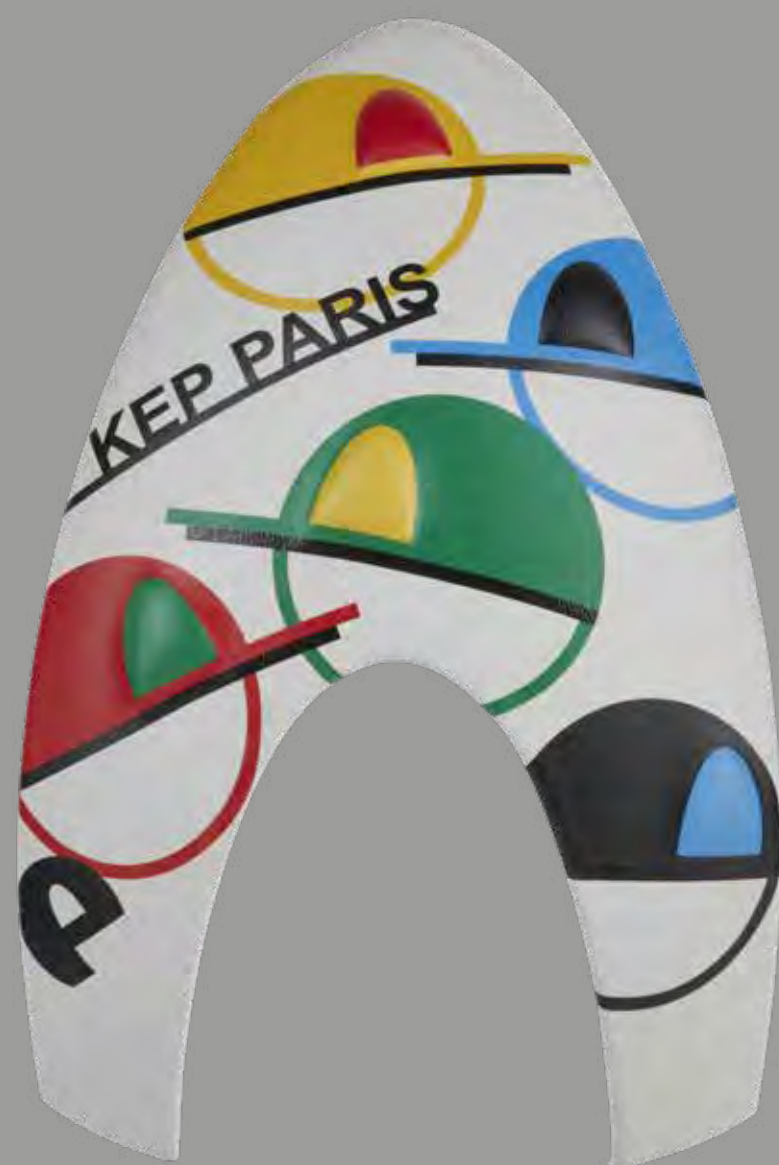
CRP2.WHT.M/L.KPA.WHT.PO CROMO 2.0 HELMET POLISH WHITE CHROME FRAME, GRID AND SUBGRID POLISH WHITE BUTTON POLISH WHITE POLO VISOR CREAM CHINSTRAP KEP PARIS WHITE LEATHER FRONT PANEL SIZE M / L